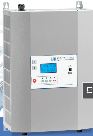
Elite PRO 2