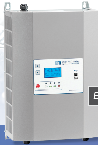
Elite PRO 4